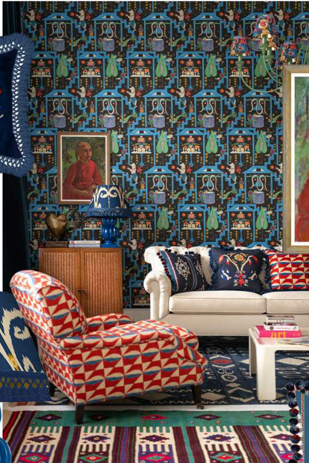
BOHO STRIPES Cushion 50 x 50 cm