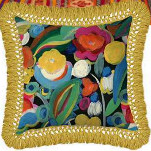
FREE FLOWER Cushion 50 x 50 cm