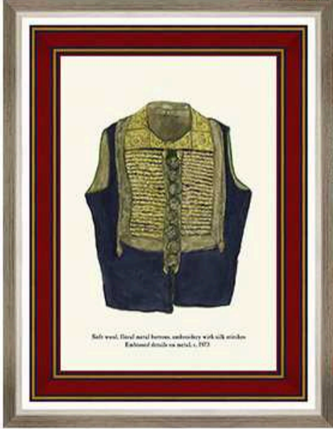
BOHO JACKET I Framed Art 60 x 80 cm