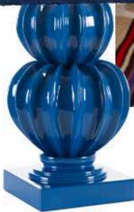
BOTANY Table Lamp in Signal Blue resin ø 18 X H41 cm