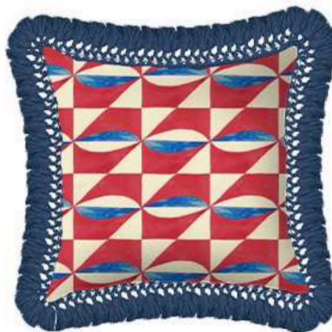
EYE SHAPE II Cushion 50 x 50 cm