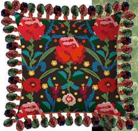
TRANSYLVANIAN BLOSSOMS Cushion 50 x 50 cm