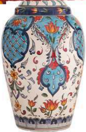
BAHAR Table Lamp in Ceramics ø 22 X H43 cm